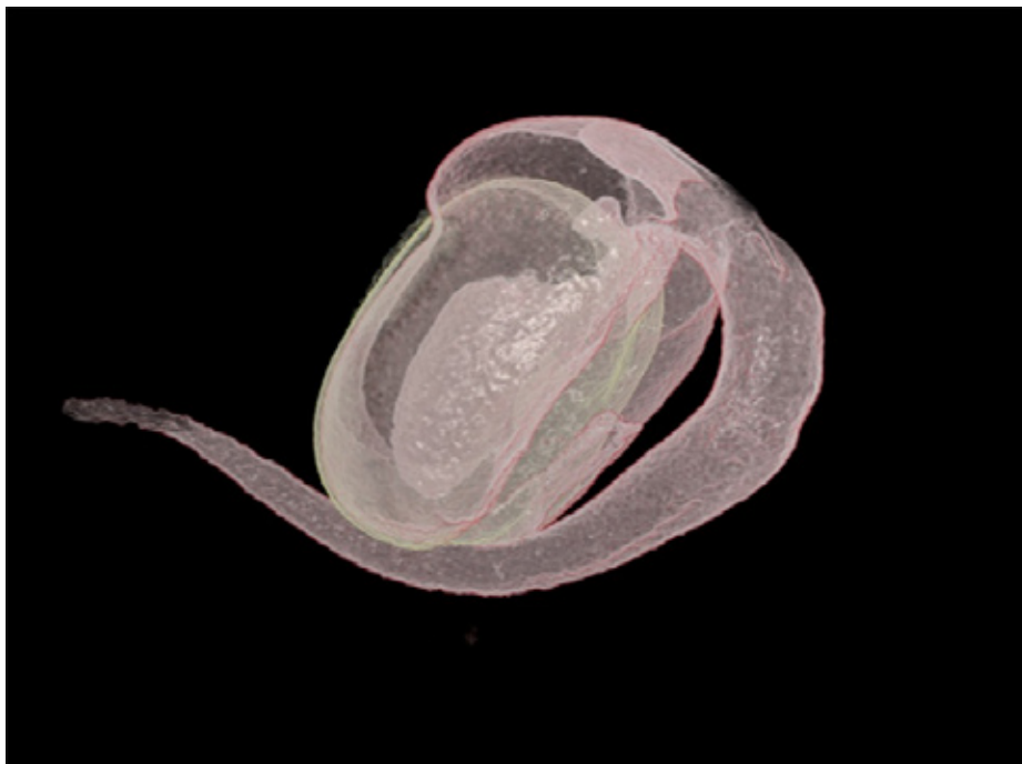
Above: A picture of a bean sprout rendered in Drishti: Erica Seccombe

"There is something crazy about the wet lab in Applied Maths; not the extreme sterile environment you would expect, but it has a fantastic experimental atmosphere of tinkering around among countless glass vials." Erica Seccombe