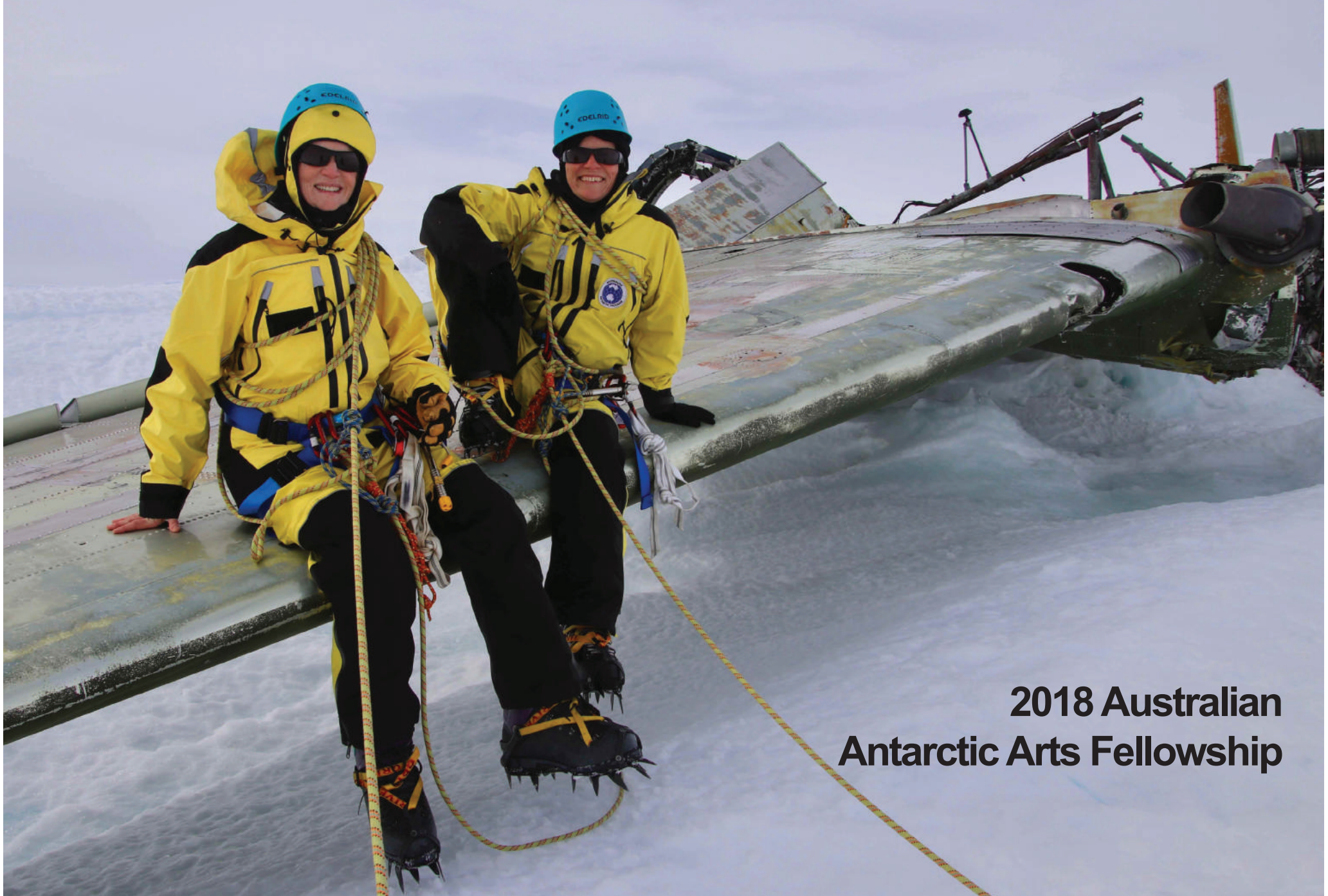
2018 Australian Antarctic Arts Fellowship