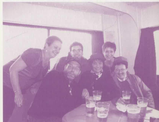
Delegates from DAC2000 cruising a fjord, Norway

Events include: DAC (the one I attended... although there are many other practices represented at this conference this area forms the backbone of what all are doing). This conference runs every year and alternates between Norway and USA. The next conference is in April 2001 at Boston University, DAC2001. NI Symposium NI Book