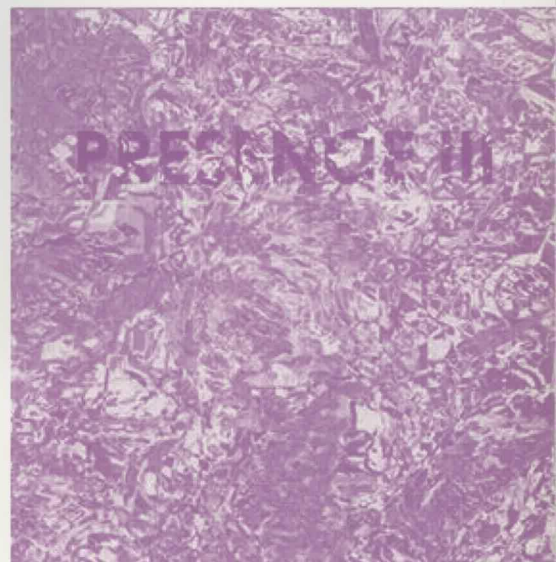
Cover Image: PeP/7 Circles Production. < http://cec.concordia.ca/CD/PRESENCE.html >

Depending upon composer's wishes, works may be placed on the CEC's web site to further the promotion of this project. Intent to participate should be sent immediately to < cec@vax2.concordia.ca >. Inclusion will be on a first-come, first-serve basis (this will be decided by reception of the work, and signed check and contract). Production will start once both CDs are filled, but compos-