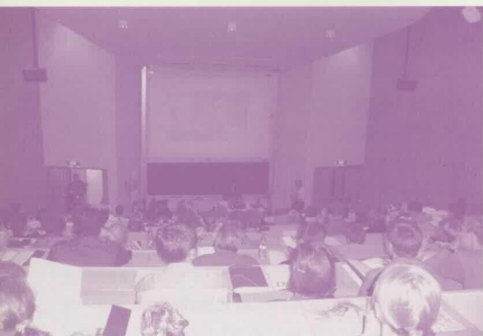
Presentation at DAC2000, Norway

As much as I thought I would be slipping away from this conference to sight see at every opportunity, I was held there, and the only slipping away I did was to catch up on some much needed sleep (please remind me about the new elbow in the ribs bot I must make that only responds to the keyword sleep on my return)...an aeroplane speciality... and a very real experience thanks to the chap in the next seat... maybe we can have a real plane instead/as well as clouds' n' lunchbox...and accumulate bots that perform all the funniest airplane stories we can gather.