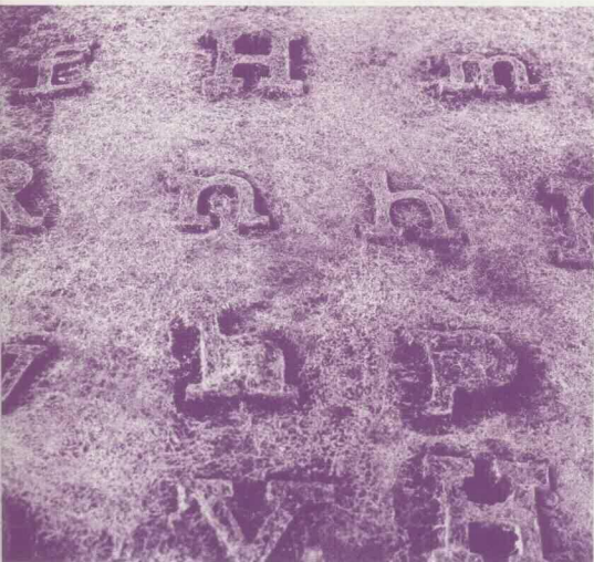
Elizabeth Day, detail, moulded grass roots, 2000