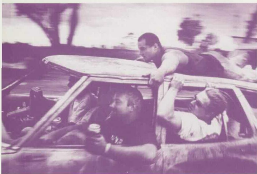
Leica Award, Centre for Contemporary Photography: Trent Parke, "Cars Speed Around Up to 80 km per hour", 1998

Leica/CCP Documentary Exhibition/ Award ENTRIES DUE: 2nd April CCP Exhibition Proposals PROPOSALS DUE: 11th May